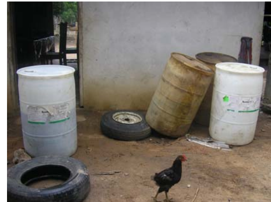
Plate 12. "Recycling" of agrochemical containers