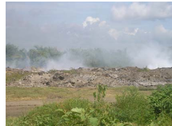
Plate 4. Organic waste from processing plant dumping Site