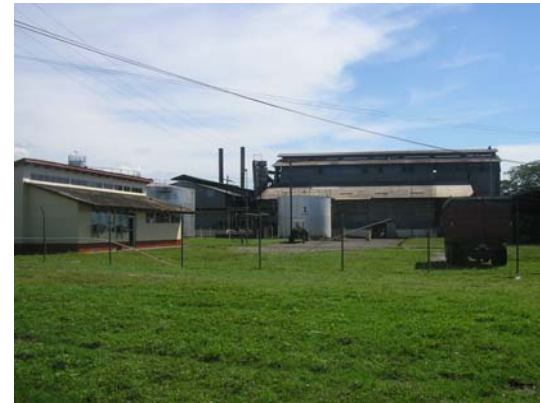
Plate 16. Palm oil extraction plant