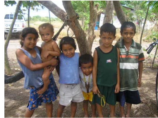
Plate 18. New generation of palm oil producers