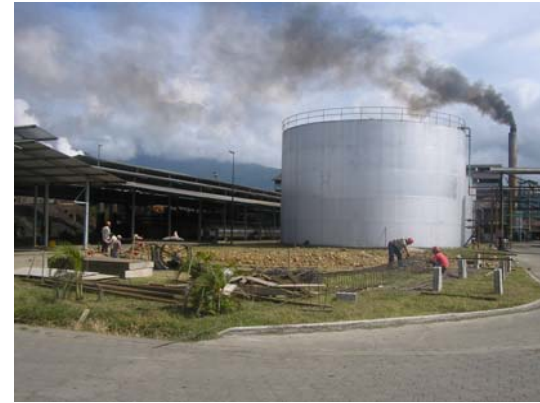
Plate 14. Palm oil extraction plant