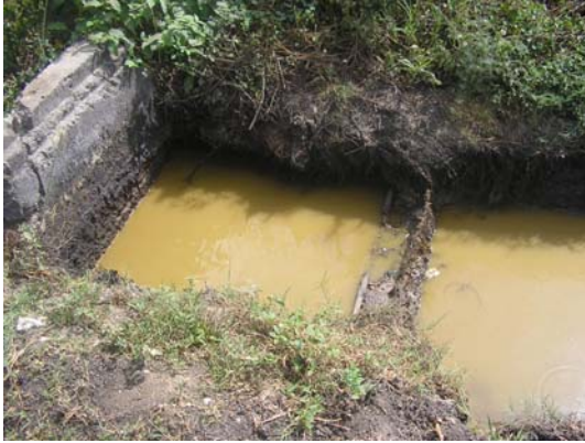
Plate 5. Water discharge effluent