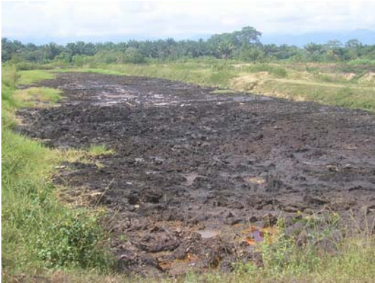
Plate 7. Water collection site