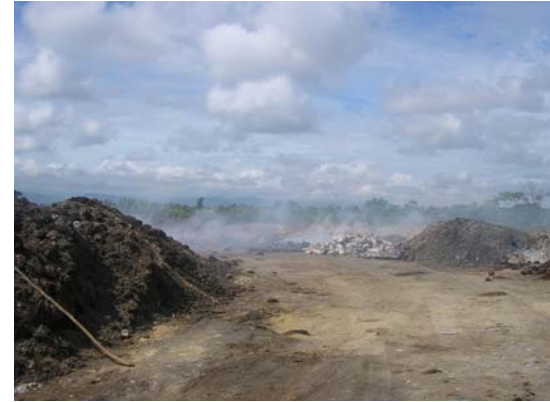
Plate 2. Organic waste from processing plant dumping Site