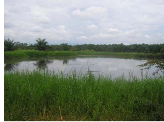
Plate 10. Water collection lagoon