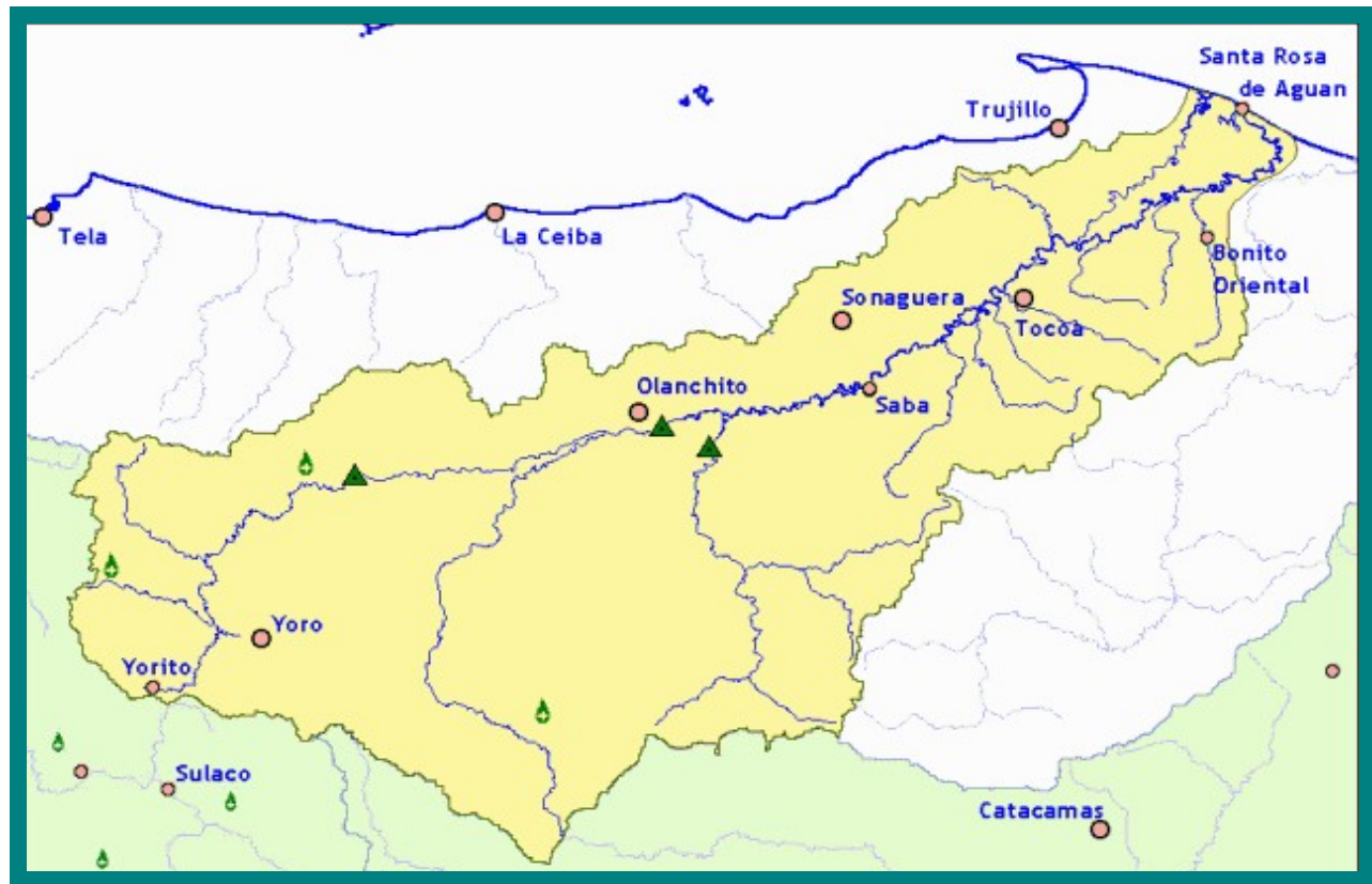
Figure 2. USGS website with Real-Time Streamflow and Rainfall Data for the Aguán Watershed. The system is part of an Early Warning Systems deployed just after the Hurricane Mitch in 1998. As July 2005.

The USAID/USGS Hurricane Mitch Program in support of hazard mitigation and reconstruction after Hurricane Mitch—ended on December 31 2001. It left an important legacy of information that together with the near-real time Monitoring System deployed by the same Program, is of fundamental importance to monitoring the health system of the Coral Reef Marine Habitats nearby the Aguán River Basin.