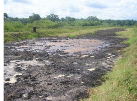
Plate 8. Water collection site