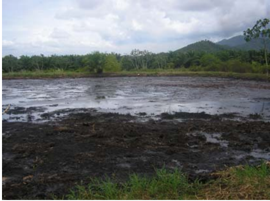
Plate 9. Water collection site