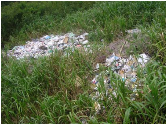
Plate 11. Non-solid waste dumping site