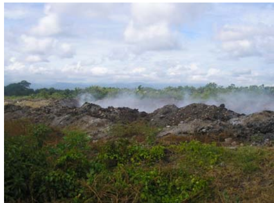
Plate 3. Organic waste from processing plant dumping Site