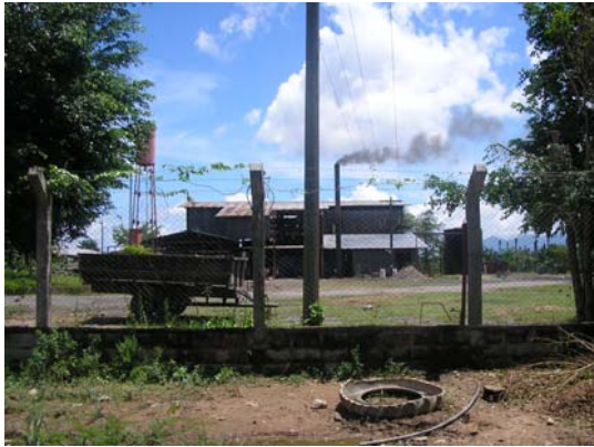
Plate 17. Palm oil extraction plant