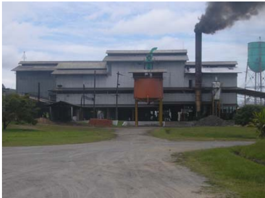
Plate 15. Palm oil extraction plant