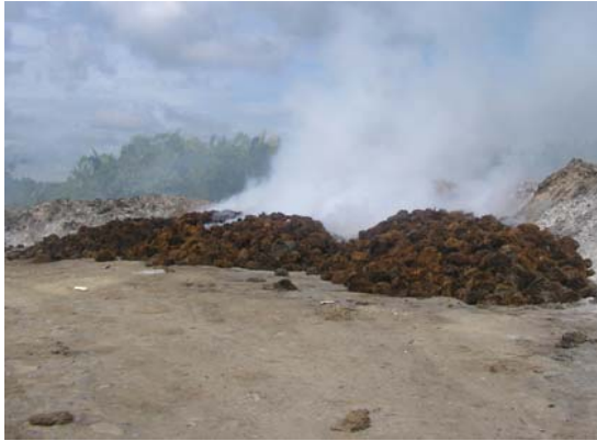
Plate 1. Organic waste from processing plant dumping Site

ANNEX 5. Disposal system used in most of the Palm Oil Industry in the Aguán River Basin to dispose for organic wastes, water effluents, and solid non-organic waste as July 2005.