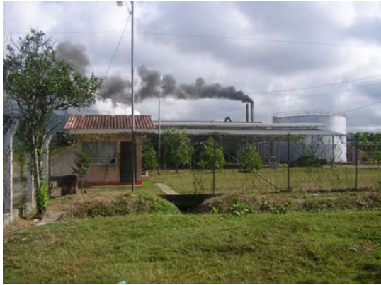
Plate 13. Palm oil extraction plant