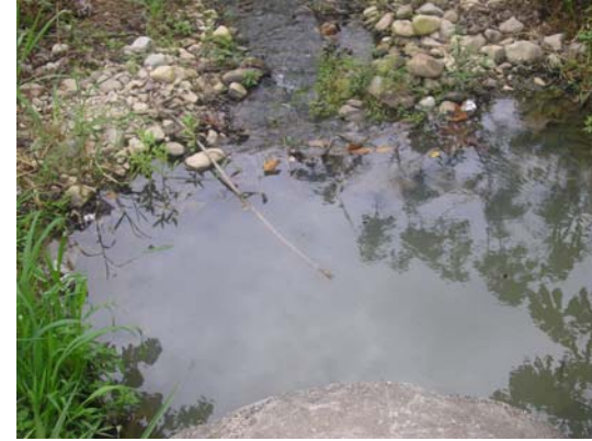
Plate 6... Water discharge effluent