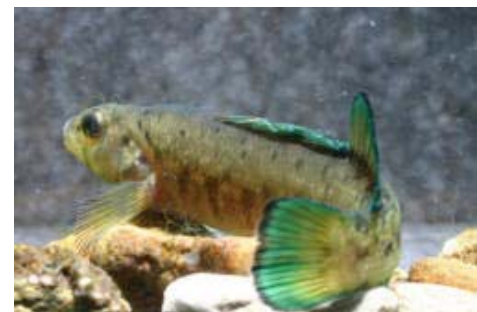
Etheostoma wapiti