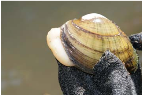
Lampsilis fasciola

Purpose The Southeast Rivers and Streams Support Fund ( The Support Fund ) awards funds to local and regional community groups, grassroots citizen initiatives and cooperative aquatic science projects working to protect, restore, and enhance aquatic species and the habitats on which they depend.