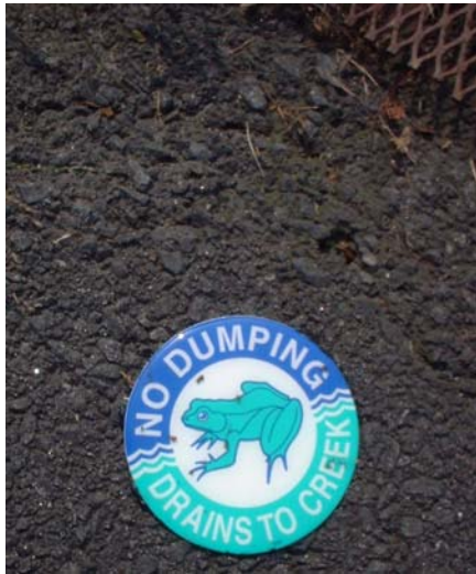
Sign near storm drain in North Carolina

Activities Not Supported The Support Fund does not fund government agencies, IRS defined lobbying activities (attempts to influence specific legislation), lawsuits (including fees to hire attorneys) or projects that have been completed.